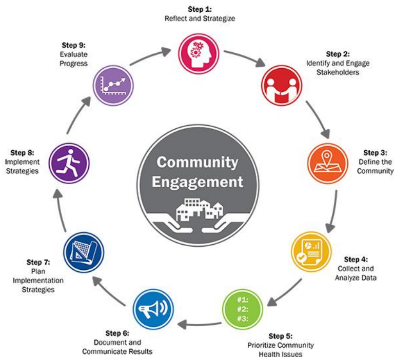
Figure 1: Association for Community Health Improvement CHNA Process Map